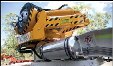
DRAKE TYRE CADDY