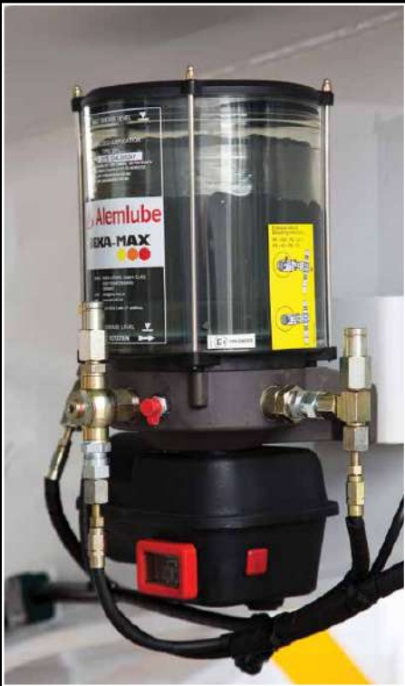
AUTO GREASING SYSTEMS